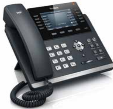
Yealink SIP T46G 12 line 27 key GigE Color