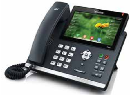
Yealink SIP T48G 16 line 29 key GigE Color

Transcom features Yealink IP Phones to power your business. Yealink is known industry-wide for its superior voice quality, handset design, and overall value.