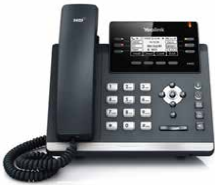
Yealink SIP T42G 12 line 15 key GigE