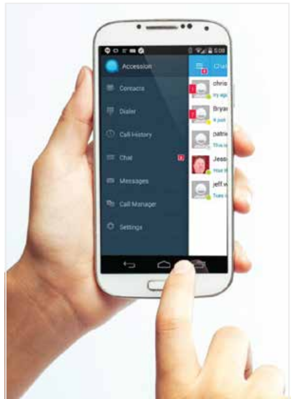
Accession Mobile makes it easy to stay connected when you're on the go.

With Hosted PBX, Transcom delivers a best-in-class phone system that allows you to buy only what you need. We take care of the details – phones, equipment, installation, training, and ongoing service – so you can focus on your business. Best of all, we're local and available around the clock to help solve any problems you might have.